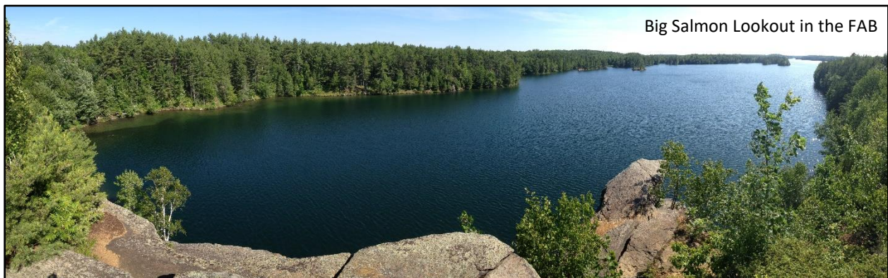
Big Salmon Lookout in the FAB

The platform will feature an interactive map listing remote and rural businesses to provide a central location for tourists to discover a variety of interesting, environmentally friendly destinations in and around the FAB. This platform was created through a partnership between Lanark County, Frontenac County, Parks Canada, and the St. Lawrence Parks Commission. Local small businesses can register with FAB Experiences to be certified as sustainable tourist attractions, with the benefits of reaching new markets, drawing more tourists, and meeting sustainably-minded travellers.