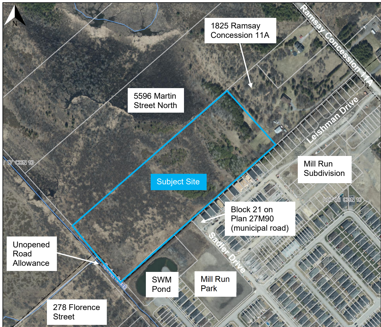
Figure 3: Subject Site and Surrounding Area