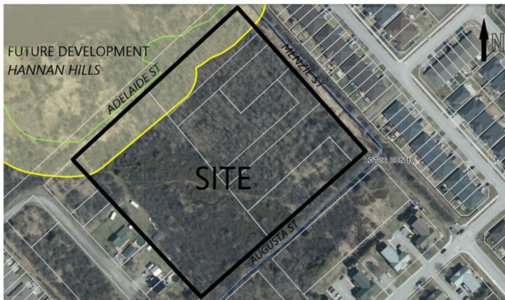
Fig. #01 - Land Location

The total area being 7.2 acres that is 2.92 hectares. Ownership proof is attached in Addendum # I .