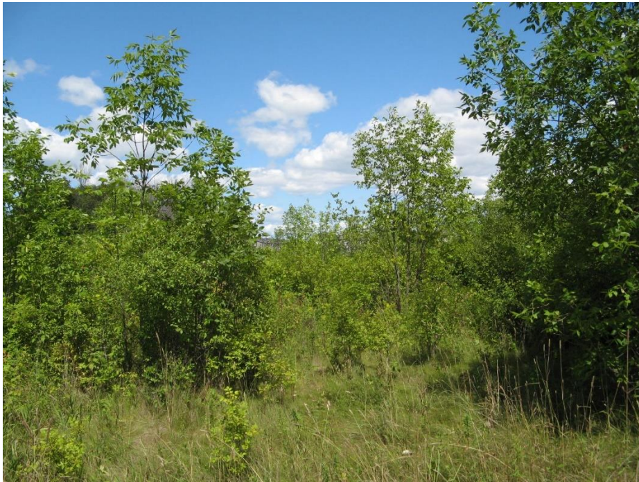
Photo 10 – Cultural thicket in the northeast portion of the site. View looking north