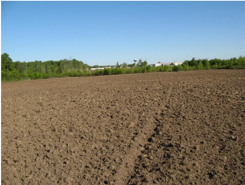
Photo 7 – Ploughed field in the southeast corner of the site. View looking north