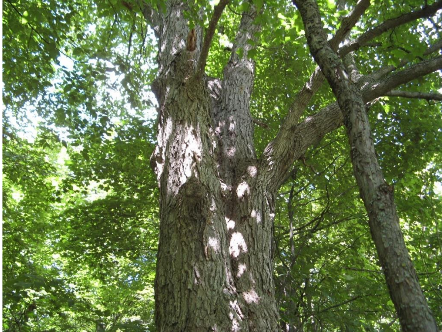
Photo 2 – Mature sugar maple along former fence line in the maple forest in the northwest portion of the site. View looking northeast