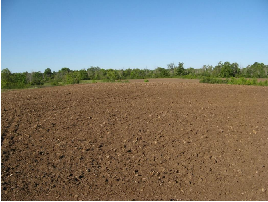
Photo 6 – Ploughed fields in the southeast portion of the site. View looking northwest to intermittent hedgerow, ploughed field, and mores established hedgerows in the background