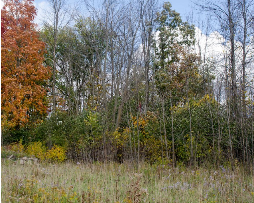
Photo 4 – Upland ash deciduous forest in the northeast corner of the site. View looking northeast