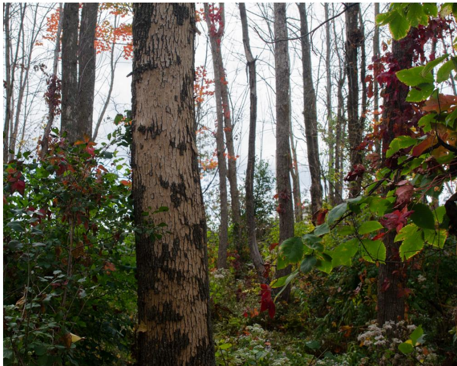
Photo 5 – Impacts of emerald ash borer on the ash forest in the northeast corner of the site. View looking west