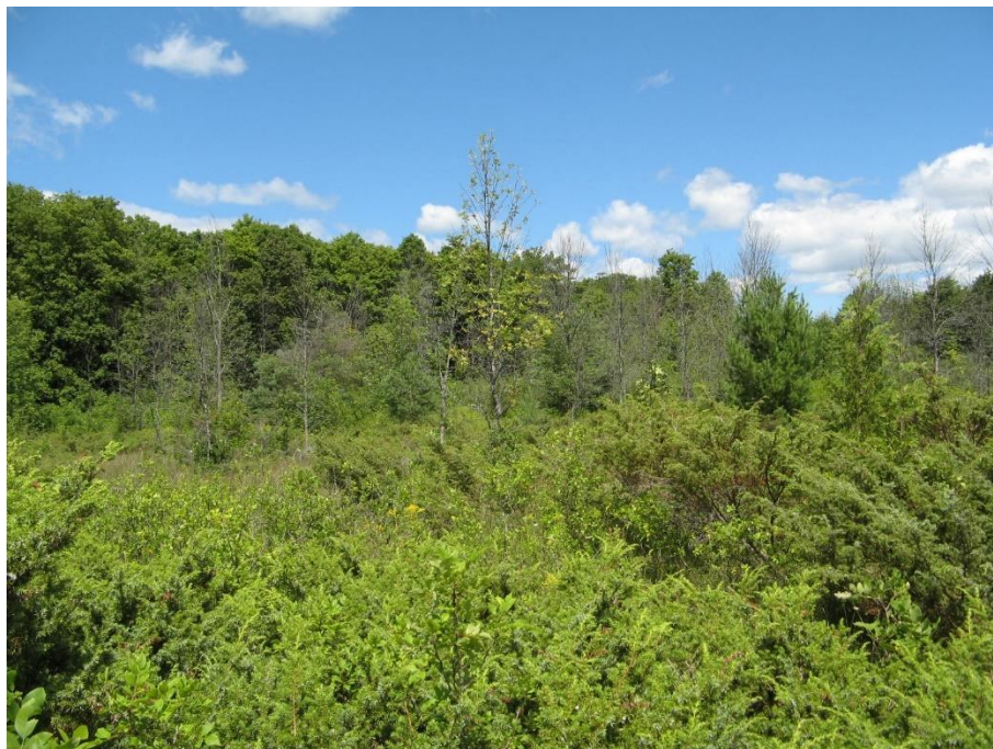
Photo 9 – Cultural thicket habitat in the northwest portion of the site. View looking northeast to the maple forest in the background