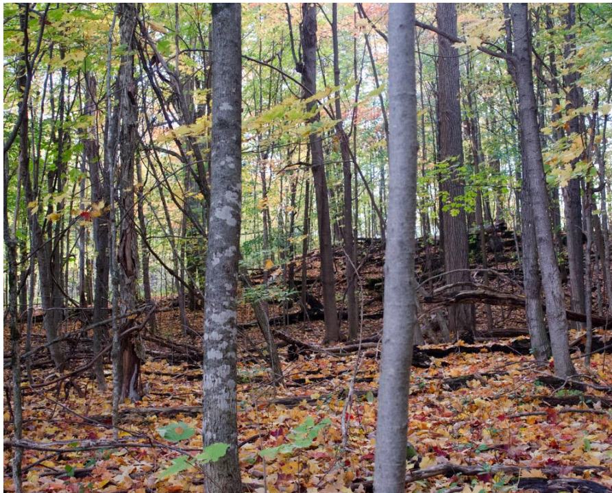
Photo 1 – Upland maple forest in the northwest portion of the site. View looking southwest

Wildlife observed during the field surveys included wild turkey with immatures, song sparrow, northern flicker, eastern kingbird, American robin, eastern phoebe, least flycatcher, great-crested flycatcher, European starling, common grackle, red-winged blackbird, common yellowthroat, yellow warbler, brown thrasher, American woodcock, American crow, American goldfinch, mourning dove, black-capped chickadee, northern cardinal, blue jay, eastern chipmunk, red squirrel, woodchuck, and white-tailed deer tracks. A few of the sugar maples in a former west-east hedgerow in the south portion of the upland maple deciduous forest contained potential wildlife cavities and a large snag was also present here. A few rock piles which may provide snake hibernacula were noted in the cultural thickets and along the edges of the meadow habitats. No snakes were observed during the 2020 field surveys, with one garter snake noted in the 2012 surveys as part of the natural heritage component of the Highway 7 South Conceptual Development Plan. This observation was approximately 450 metres to the northeast of the northeast corner of the current site.