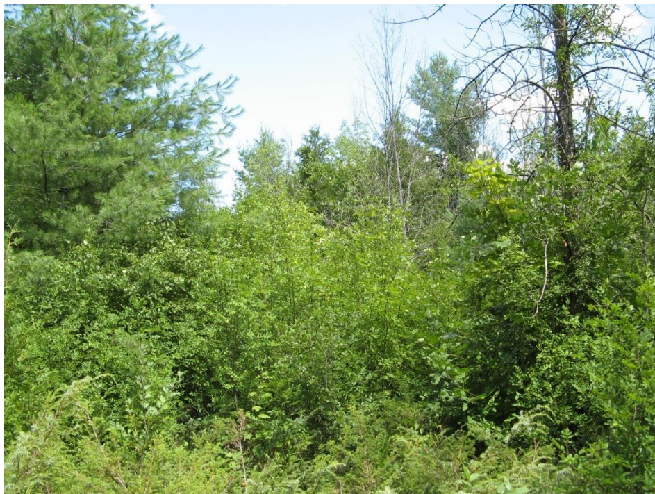
Photo 11 – Cultural woodland in the north-central portion of the site. View looking southeast