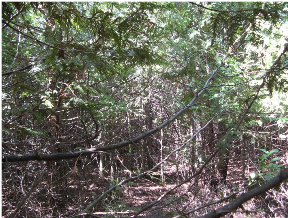
Photo 3 - Typical tree size and density of the upland cedar coniferous forest in the west portion of the site. View looking northwest