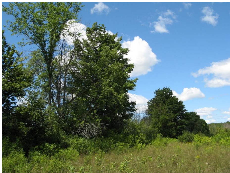
Photo 13 – South portion of north-south deciduous hedgerow in the east portion of the site. View looking northwest