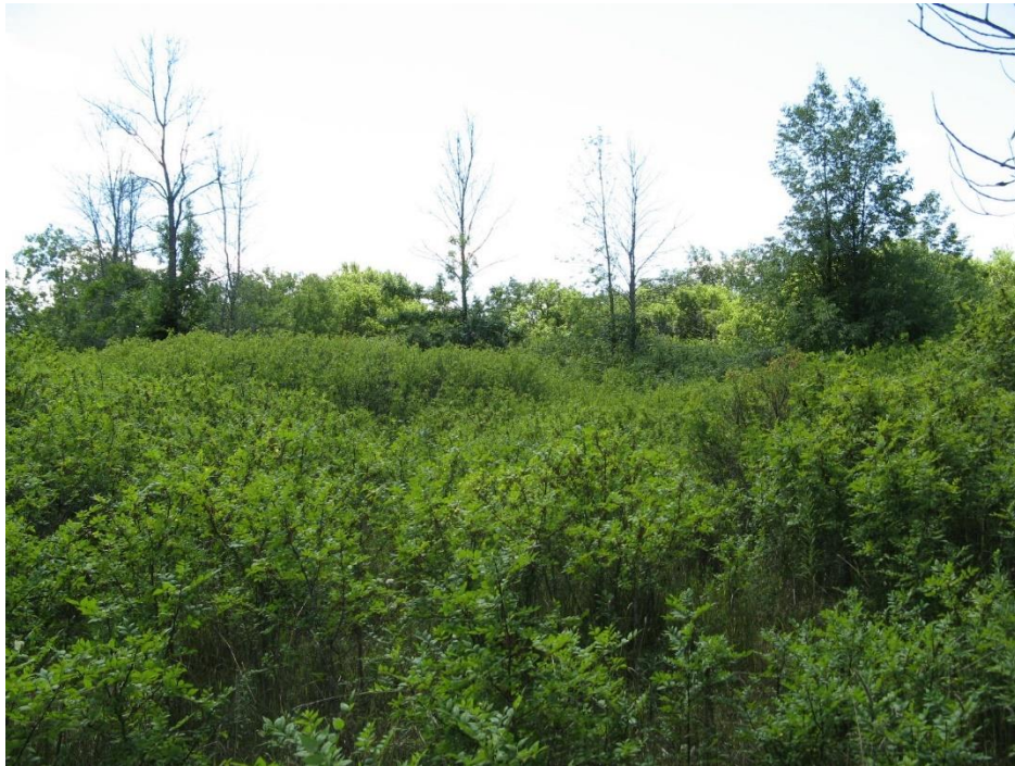
Photo 8 – Dense coverage of prickly ash in the thicket habitat in the west-central portion of the site. This is not fun walking! View looking southwest