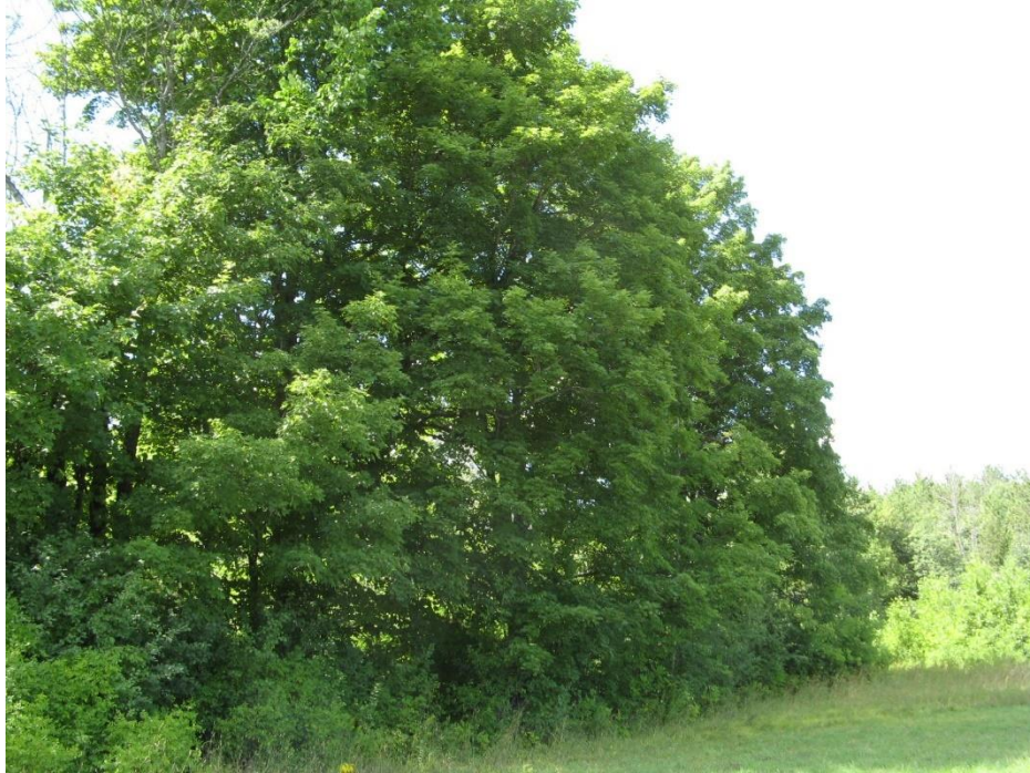
Photo 12 – Mature sugar maples in the north portion of the north-south hedgerow in the central portion of the site. View looking northwest